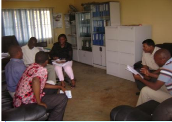
TBIF team meeting with MVK Officer MVK Officials